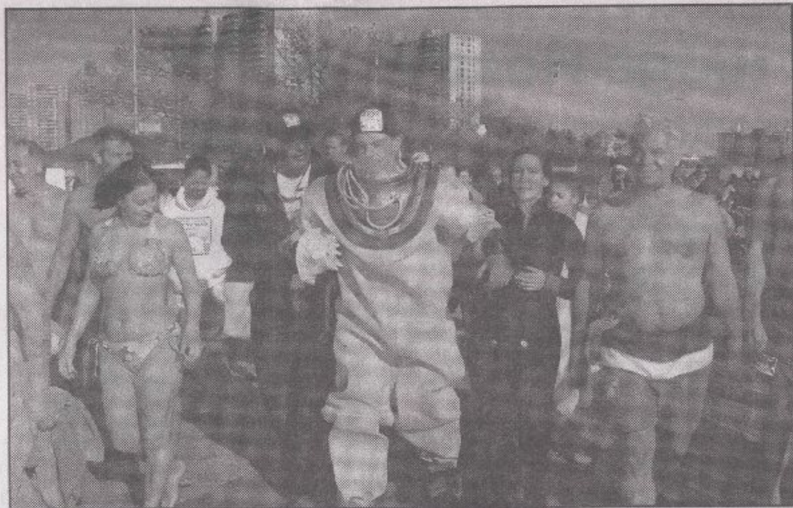
Intrepid swimmers aim for the water.