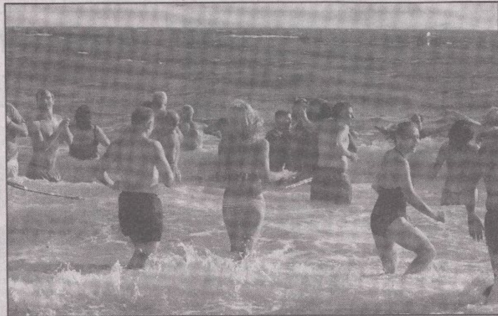
Polar Bears refresh themselves with a daredevil douse in the Atlantic.