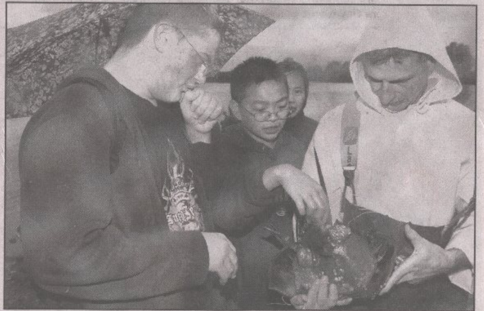
Students carefully examine a horseshoe crab as a New York Aquarium instructor leads them on a hands-on lecture.