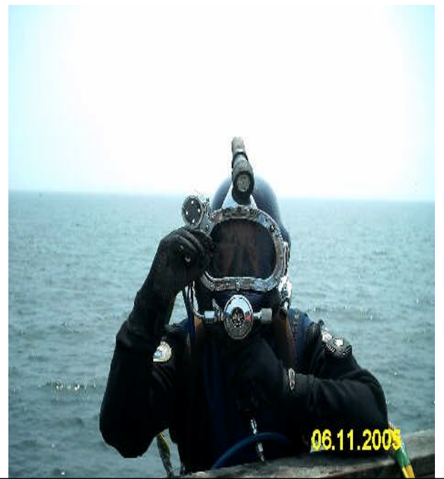
(Above) A Research Diver enters the water for the Classroom on the Pier Program. (Below) The Research Diver exiting the waters of Coney Island

The commercial divers explore the sea floor, using the latest in high-tech underwater video and communication systems, to broadcast this unique program to the students on the surface. The future will likely bring live Coney Island underwater video links from over the Internet to every school appropriately wired. The Research Diving program is a collaborative effort of many experts working together by combining their different fields of expertise. The end result is a winning, innovative educational strategy for Coney Island.