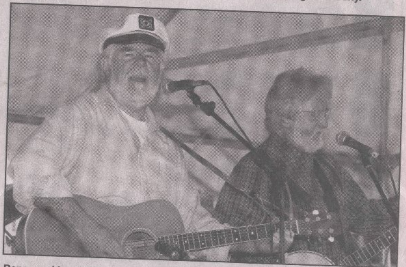
Renowned band "Stout" perform a medley of their hit songs.