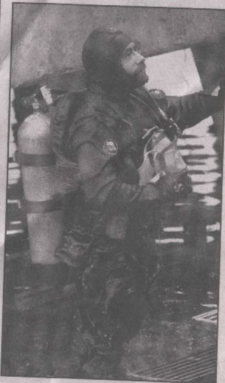
A diver emerges from the water after a conducting an underwater demonstration.