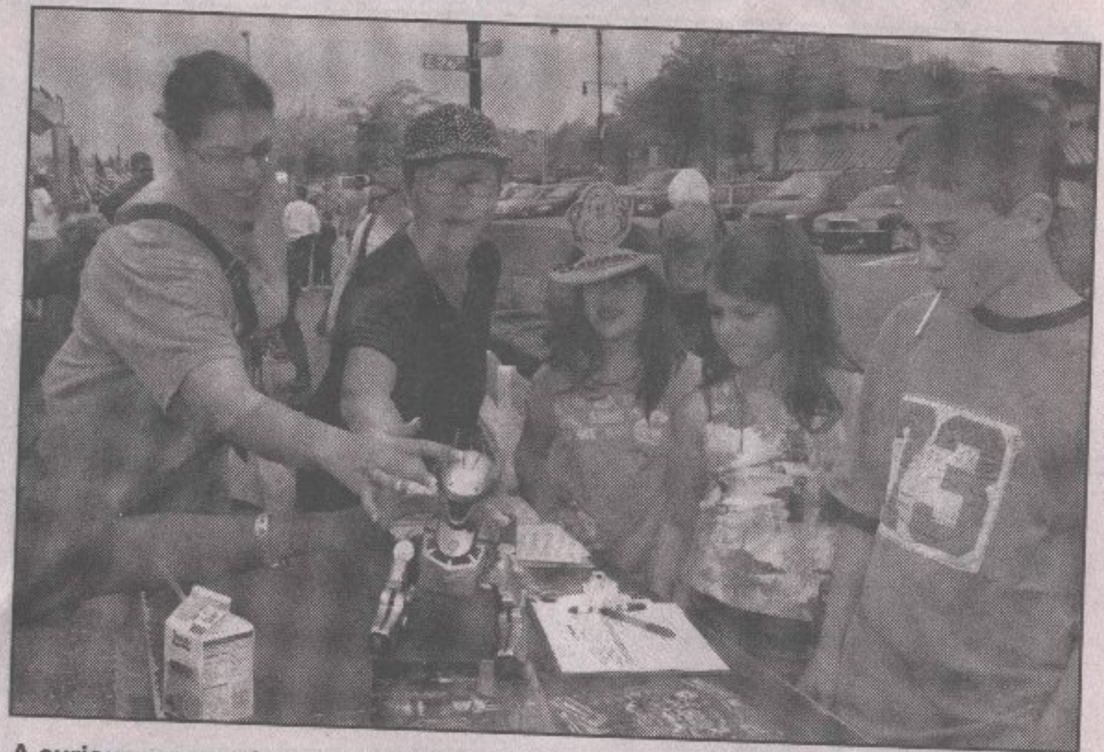
A curious group of visitors check out "Aibo" the robotic dog from Sony.