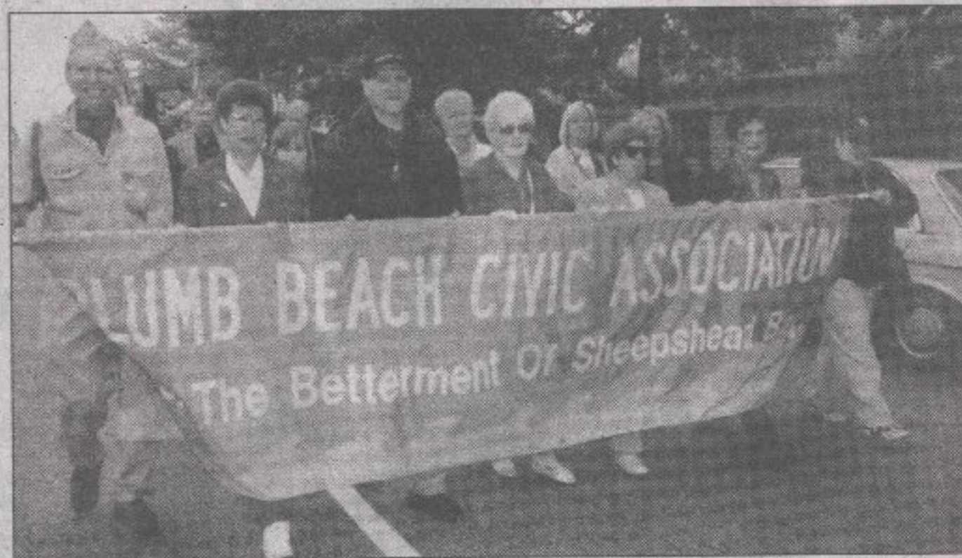
A banner group from the Plumb Beach Civic Association marches along Emmons Avenue.