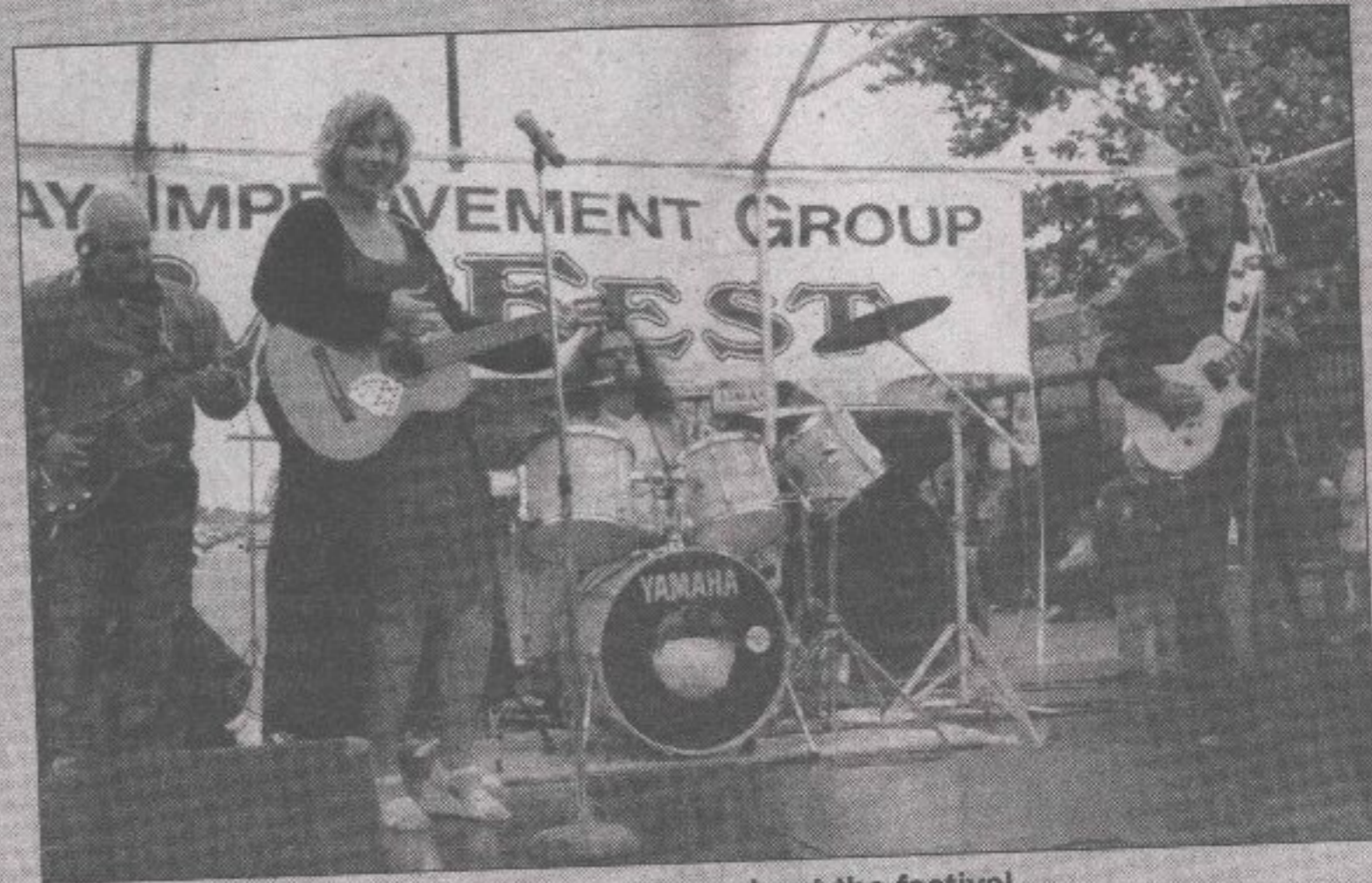
Live music serenaded merrymakers throughout the festival.

Bayfest 2001 is sponsored by Sunrise Assisted Living, Astoria Federal Savings, Arizona Iced Tea, Kings Auto Group and Courier-Life Publications.