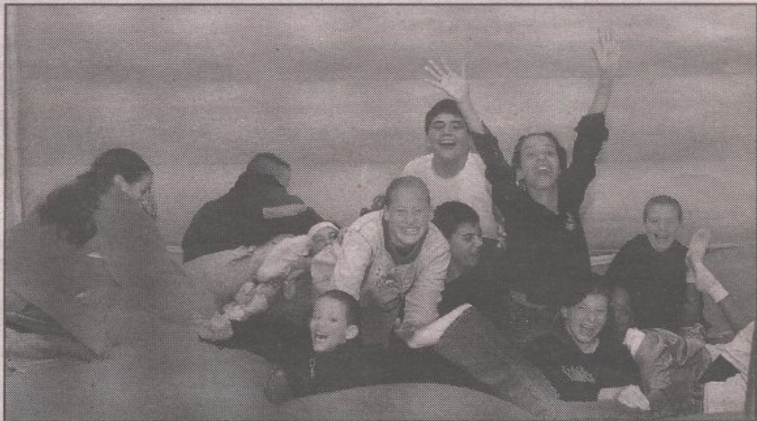
Youngsters take a walk on the wild side.