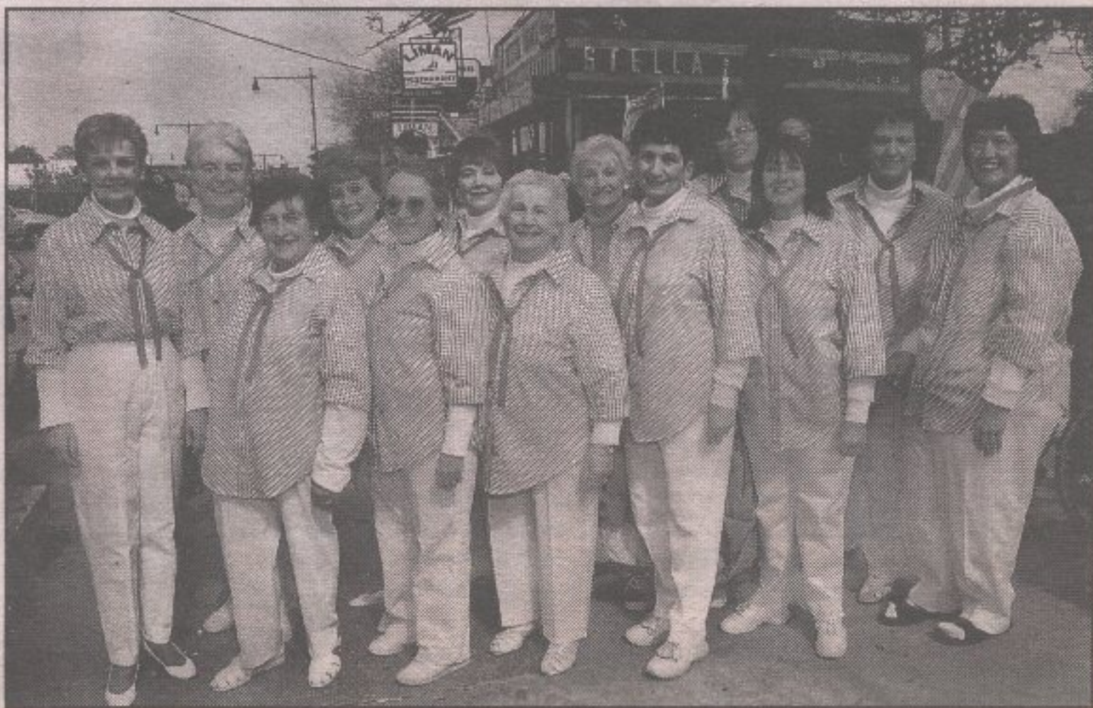
The Brooklyn chapter of the Sweet Adelines serenade revelerfs.